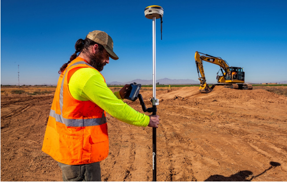
Without needing to focus on a bubble, more time can be spent measuring points.

vehicles, stop signs, fences, construction equipment, and other items regularly found at every construction site. These factors lead to very inconsistent results and a skeptical public.