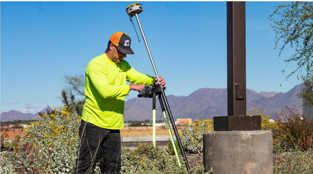
Hard to reach points are easier to get to.

The market demanded something better; enter the Inertial Measurement Units (IMUs). An IMU (Inertial Measurement Unit) uses accelerometers and gyroscopes to calculate linear motion and angular rotation. Combining IMU data with the RTK GNSS position allows for accurate yaw, pitch, and roll calculations not subjected to magnetic interference and not requiring long and complicated calibration routines.